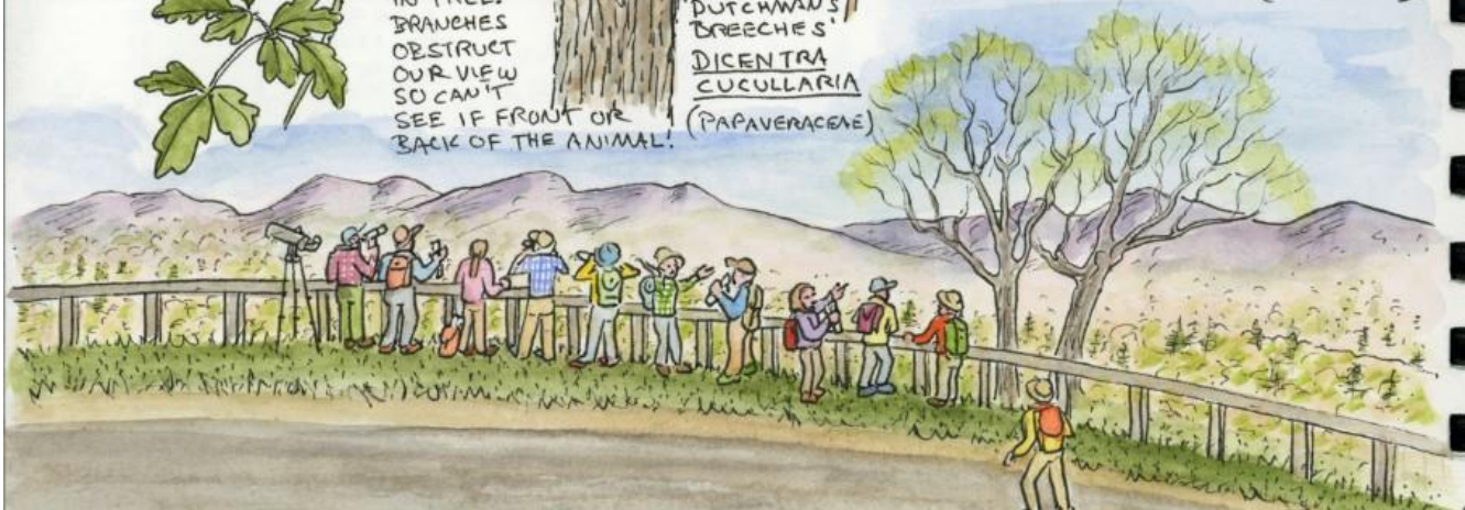
Illustration by nature journaling artist Doreen Bolnick used with permission on this WSPA website only

TROUT LILY ERYTHRONIUM AMERICANUM (LILIACEAE)